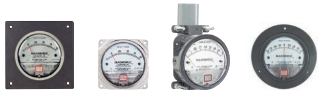
Flush, Surface or Pipe Mounted

*For applications with high cycle rate within gage total pressure rating, next higher rating is recommended. See Medium and High pressure options.